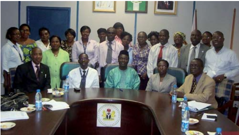
Maiden meeting of the Global Fund HIV Round 5 implementers called by the Federal Ministry of Labour and Productivity, Abuja Thursday, September 17, 2009. PR- NACA and AED/Nigeria were in attendance

The meeting also noted that poor documentation and motivation of field staff were key challenges to accurate statistical data recording.